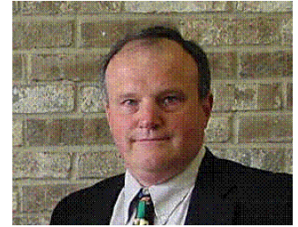
The semi-annual tie time!